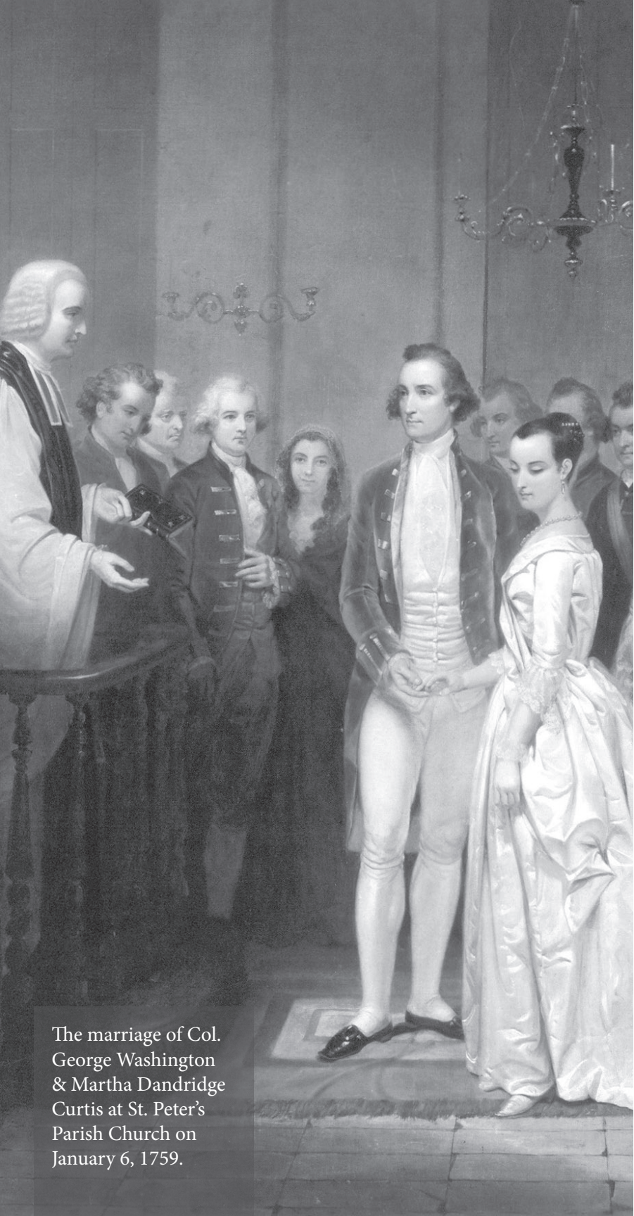
The marriage of Col. George Washington & Martha Dandridge Curtis at St. Peter's Parish Church on January 6, 1759.