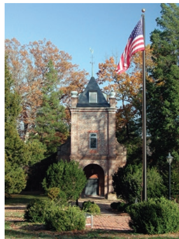
St. Peter's Parish Church, New Kent County, Virginia (Episcopal)

For where your Treasure is, there Will be your heart also. For unto whomsoever Much is given, of him Shall much be required; And to whom men Have committed much, Of him they will ask more.