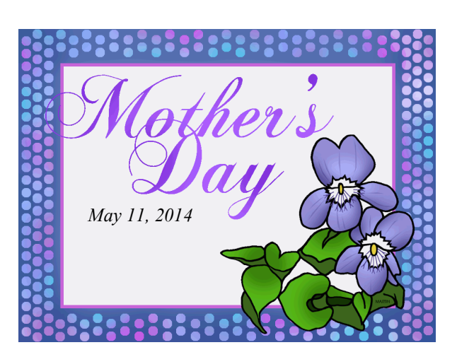
Happy Mother's Day to ALL Women!