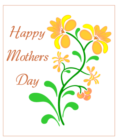
... to ALL women on this special day! May 10, 2015