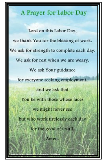
Labor Day ~ September 7, 2015