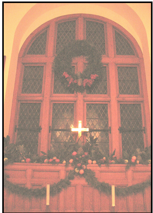
Christmas 2009 at St. Peter's