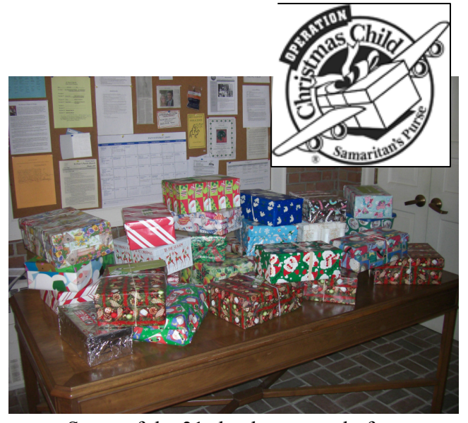
Some of the 31 shoeboxes ready for Samaritan's Purse.