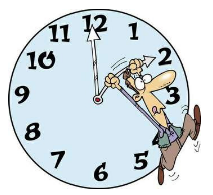
SPRING forward on Sunday, March 9!