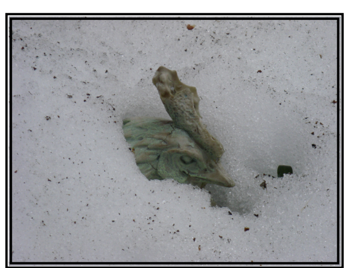
Where am I? This can't be St. Peter's!