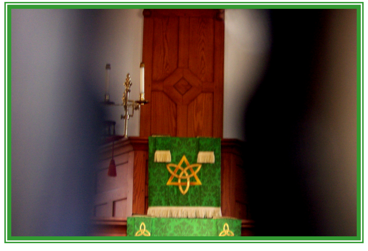
A Key Hole Perspective Shared by a St. Peter's visitor