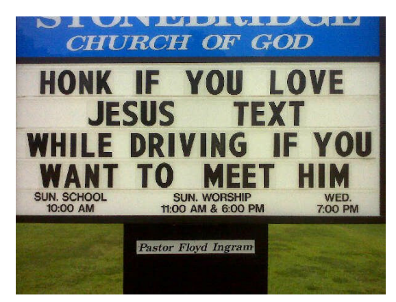
Seen on Facebook