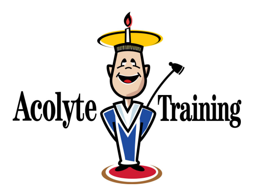
Sunday, October 2, 2011 10:30 am in the Church